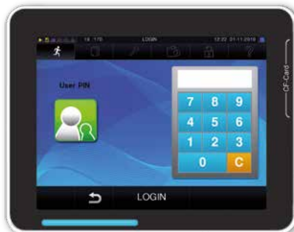
Individual operator PINs