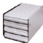
Mount >B< for 4 standard tray cassettes