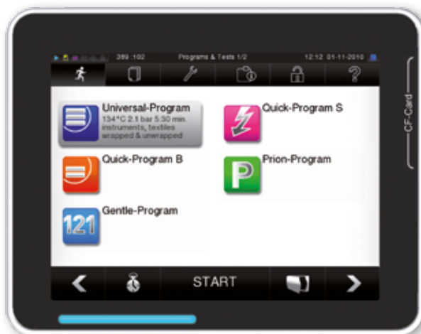
The menu for selecting the sterilization programs

Autoclave operation needs to be simple, error-free and fun. The intuitive operation of the autoclave using an extra-large colour-touch-display enables quick program selection, options settings, individualization of the display colour and much more. This display is unique, providing as it does, the world's largest colour-touch-display to be found in a large-scale production practice autoclave.