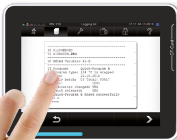
View the log on the display

Many practice workers see documentation as a necessary but unpleasant task. The new operating concept and the large colour-touch-display enable a documentation procedure which saves time and is fun to use.