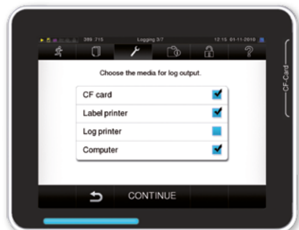
Individual and multiple output media can be selected very easily

Premium-Plus-Class autoclaves represent a modern system catering for the needs of every practice, including documentation via your practice network, the Ethernet system interface and barcode label printing up to log issue on the CF card or the MELAprint 42 log printer.