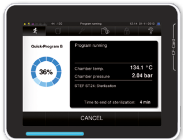
The sterilization run is displayed in a clear and easy-to-read fashion.