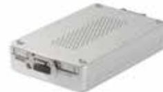
MELAstore-Box 100 and 200