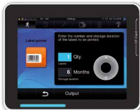
Selecting the number of labels and maximum storage period