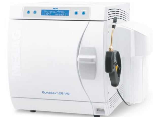
MELAdem®40 und MELAJet® mounted on the Euroklav® 29 VS+

Operating the autoclaves should be both pleasurable and safe. The design fully supports this demand. It shows what's essential, and does its work efficiently. The large door lock is not only a design feature, but also ensures a safe and easy opening and closing of the door.