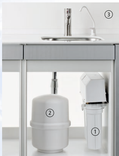
MELAdem®47 (1) installed in a sub cabinet with water tank (2) and tap (3).