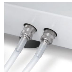
quick release connector

The large integrated funnel-shaped opening of the water storage tank makes it easy to fill the tank with demineralized or distilled water in the Euroklav® 23 VS+ and 29 VS+. Alternatively, both autoclaves could be fed the required water supply from any external reserve vessel or even be connected to a water-treatment unit.